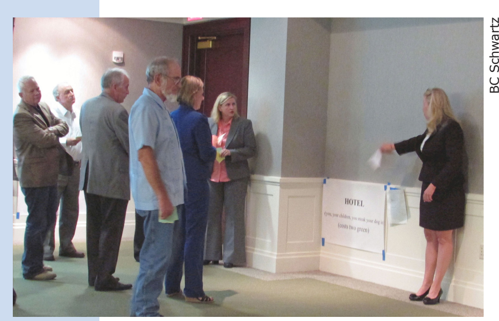
Judge Kelly explains the "Choices" exercise, in which each participant plays the role of a victim of domestic violence; here, she reminds them that only those with enough "money cards" can take refuge in a hotel.

The attendees' evaluations underscored the usefulness and effectiveness of this program. Asked what they found most beneficial, they responded with comments like, "The diligence and industry of the presenters